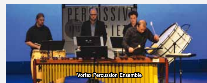
Vortex Percussion Ensemble